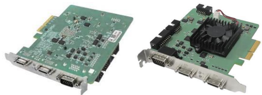
ST-sCLPE4 Full Pro